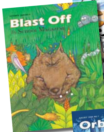
BLAST OFF (interest level 9-10 years old)