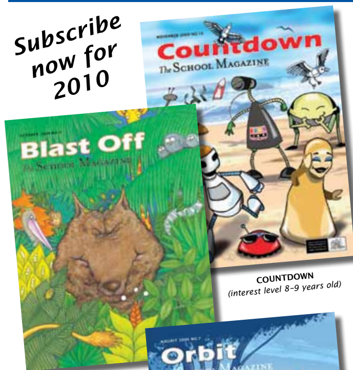
COUNTDOWN (interest level 8-9 years old)