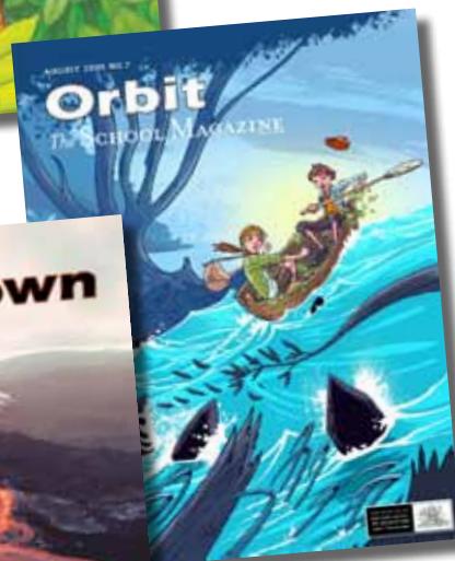
ORBIT (interest level 10-11 years old)