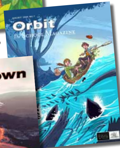
ORBIT (interest level 10-11 years old)