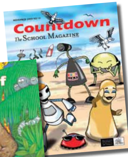
COUNTDOWN (interest level 8-9 years old)