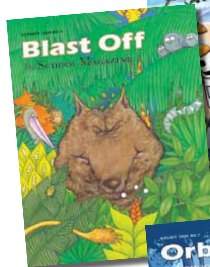
BLAST OFF (interest level 9-10 years old)