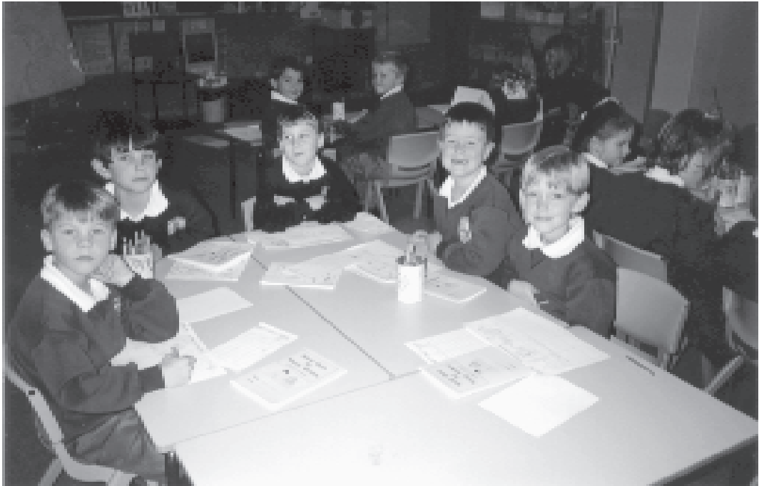
Students in this Year 1 class use word bank books and their have-a-go sheets in their writing.

The difference between acronyms and abbreviations, and which are more effective, can be discussed. Look for examples in government departments, media and advertising. Students can make up simple and amusing acronyms for local use.