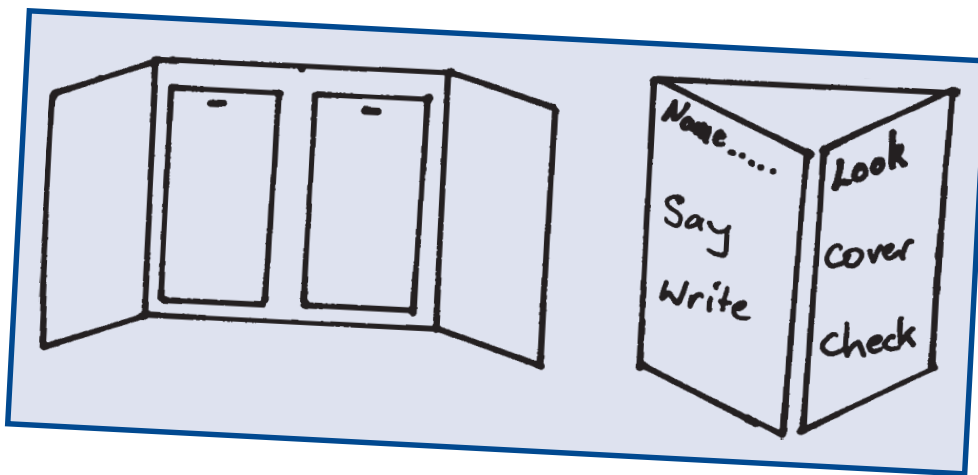
The “look, say, cover, write, check” folder

The student looks at the word, says it (perhaps s-t-r-e-t-c-h-ing it out to help articulate sounds), covers it up, writes an attempt and then checks carefully against the original. Repeat this process if the word is incorrect the first time.