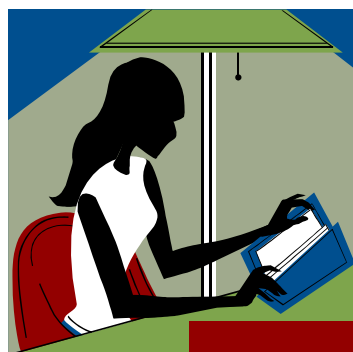
Have a well-lit and comfortable workplace