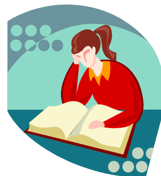
Read, write and speak aloud